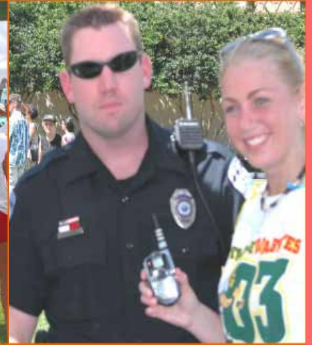
ABOVE LEFT: As many as 3000 people of all ages attended the 2003 Walk and at times they swarmed across the Meyer Amphitheater field. The Lost Child & Communications Booth was centrally located and its banner could be seen from most anywhere. ABOVE RIGHT: FRS radios were used to coordinate with the event staff, onsite Wackenhut security and the West Palm Beach PD patrolling the perimeter.