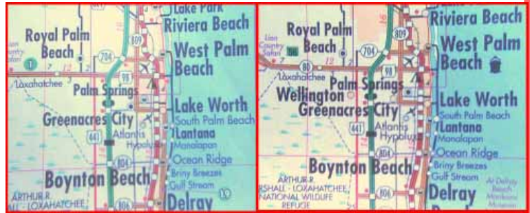
1996-2002 OFFICIAL MAPS