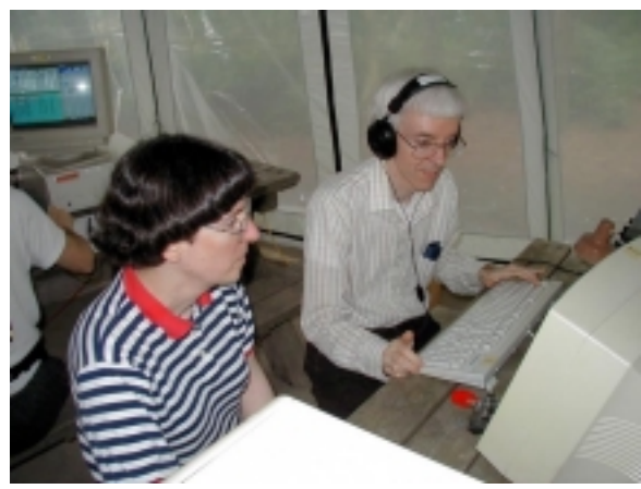
The ARRL Letter Vol. 21, No. 33 Aug. 23, 2002 PENDING CITEL RESOLUTION IS A STEP TOWARD GLOBAL HAM TICKET

Ham radio has moved another step closer to an internationally recognized license. Delegates to the Third Regular Assembly of the Inter-American Telecommunication Commission (CITEL) this month approved a resolution that would extend reciprocal recognition of the International Amateur Radio Permit (IARP) Convention to member states of the European Conference of Postal and Telecommunications Administrations (CEPT).