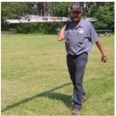
Seting up the antennas for Field Day

site<<hackstyle="color: blue;">site</hards/ariss.gsfc.nasa.gov/EVAs/amsat01.pdf>>.