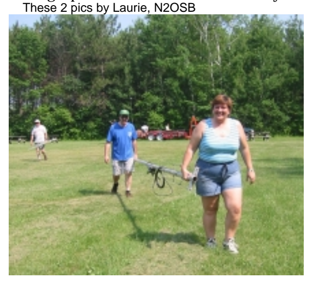
MORE AARA Field Day 2002 pictures can be viewed at the AARA web page then to the meetings and locations tab