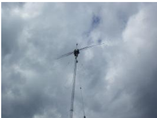
Ernie, K2EP up the tower