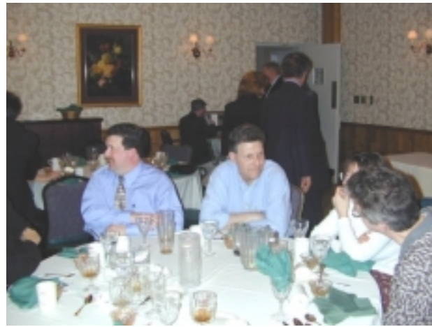
AARA Dinner 4/12/2002

More DINNER pictures at the AARA <u>web page</u> then to the meetings and locations tab