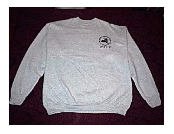
Full front AARA