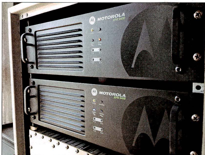
Figure 3 — A pair of Motorola DMR repeaters.

Some manufacturers supply programming software at no cost. Motorola Solutions