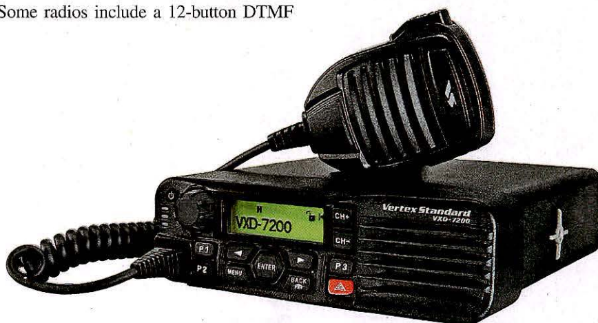
Figure 4 — This Vertex Standard mobile DMR transceiver has a monochrome display.

First, you need a subscriber ID. The DMR-MARC website issues all subscriber