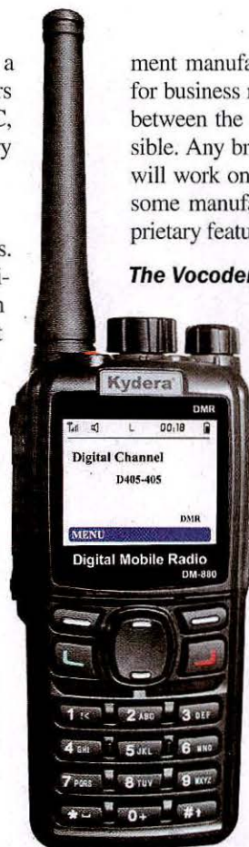
Figure 1 — A DMR handheld transceiver can have no display, a monochrome display, or a color display like this Kydera model.

many more areas, and most are interconnected. Not all of the amateur DMR repeaters are connected to the wide area networks. Some are standalone, either because they have yet to obtain an ISP connection at their repeater site or because they just prefer to use the repeater for local communications. Some standalones are operating in dual-mode (analog/digital), which allows the repeater to support both digital and legacy analog users. MOTOTRBO repeaters operating in dual-mode do not support interconnection via the Internet using IPSC.