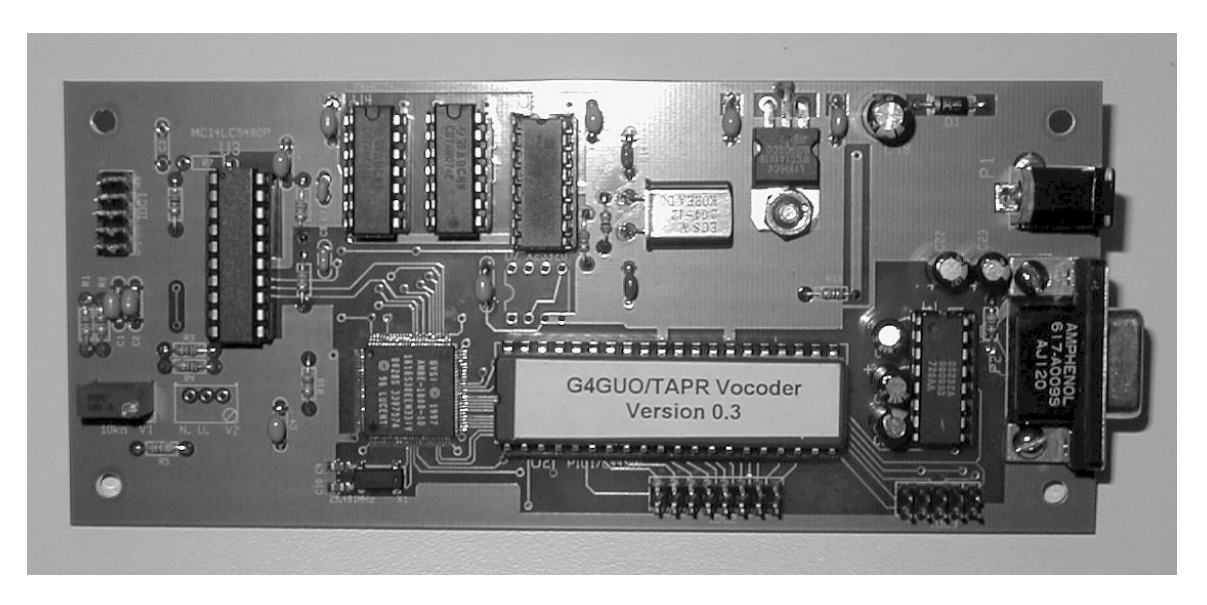
Figure 1 – G4GUO/TAPR AMBE-1000 Beta Vocoder

into several frequency bands ( Multi-Band ) from which pitch and other spectral parameters are determined and coded.