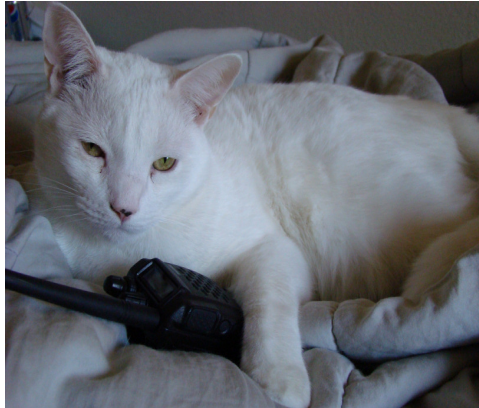
Great time to get your friends involved in the club!