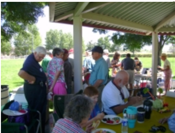
Enjoying the Food!