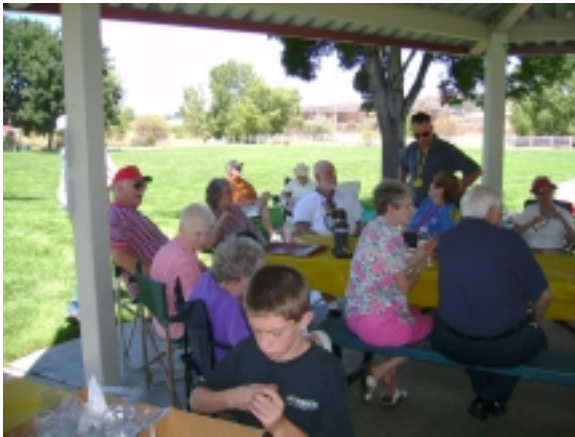
Waiting for the Food!