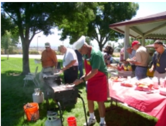
Cooking the Food!