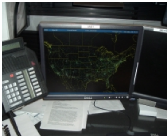
Operator's Position shows all targets simultaneously