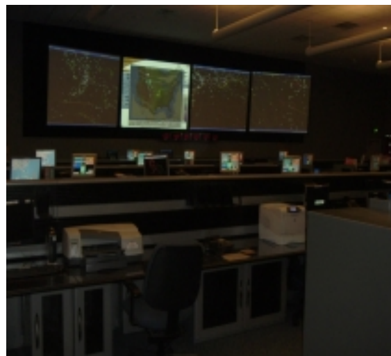
Operations Floor View Large screens show Border detail