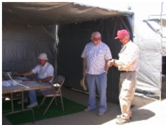
The Get On The Air (GOTA) Station

Please do not forget that tear-down on Sunday, June 25 also requires considerable effort by volunteers to carefully take apart the facility items and re-store them to their storage places and to clean up the site to its original condition.