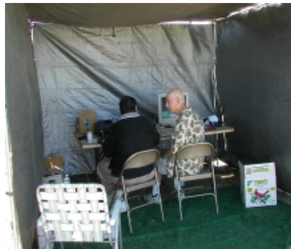
One of the Few!