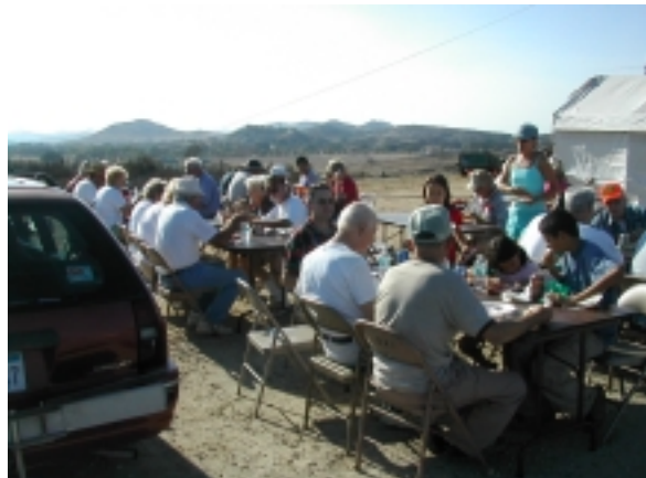
Dinner at the Field Day Site, '04

[Monitoring the frequency (146.805 MHz) is something that we all could do when at home or on the road. It could catch on and become an informal net opportunity! ED]