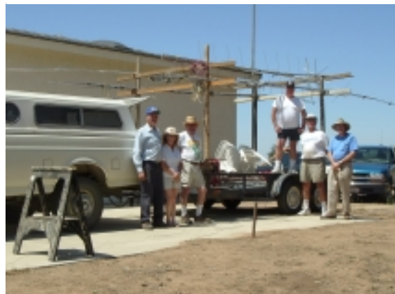
Ready to move out