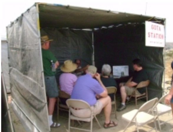
The GOTA Site was busy!

The adjacent photos represent only a few of the workers and visitors present on Field Day. Many others were there and photographed, but there is not space in this issue to present them all.