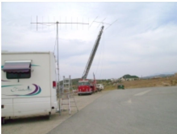
Portable Antenna Tower!