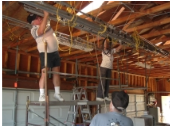
Removing items from storage

A total of 673 contacts were (unofficially) made.