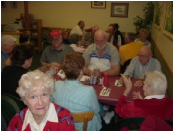
Having fun at lunch at Honeycutt's

So, let's all mount our crystals and oscillate!