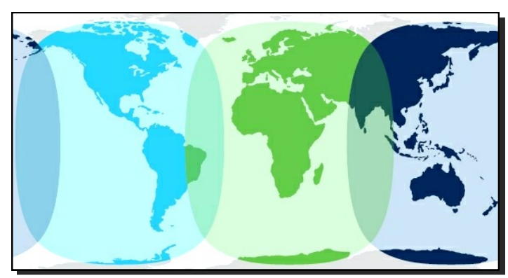
Showing BGAN Coverage Using 3 Satellites

her battle with breast cancer. is the antenna which is pointed toward a satellite that is Almost 52, she fought in a stable, geosynchronous orbit. Once the terminal finds the satellite, no more movement is needed as the satellite never changes its position.