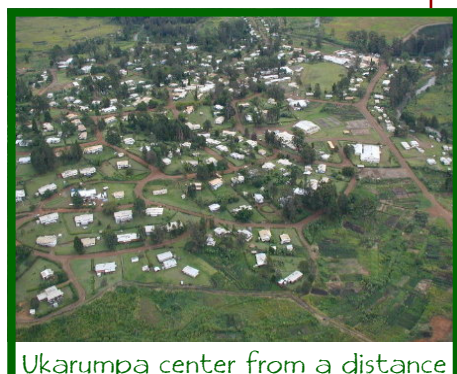
Ukarumpa center from a distance

the touch down on the one way airstrip meant we were finally back again. What a treat! Then to be greeted by our kids who serve there, was special. After several months of planning we had finally arrived.