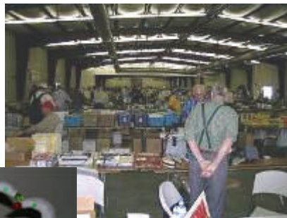
A Building Full of Hamfest Stuff