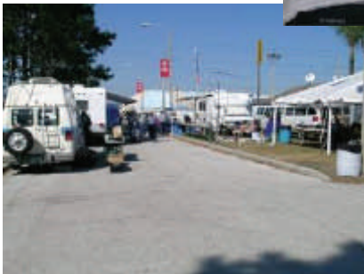
Even More Stuff