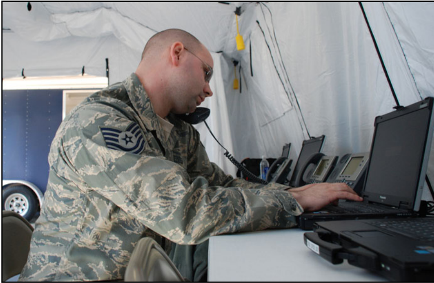
View of an operating bench of the new "command post in a box" based at Westover Air Reserve Base, Massachusetts. The Joint Incident Site Communications Capability (JISCC) system serves as a giant router capable of interconnecting multiple civil and military communications channels in a disaster area. Two trucks plus a trailer (visible through the opening in the background) transport the modular installation to the scene.