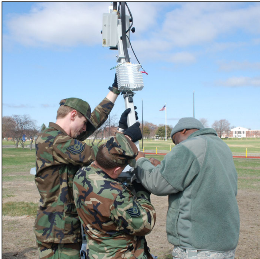
Members of the 439th Communications Squadron take part in an exercise with the Joint Incident Site Communications Capability system in April. Westover is the first Air Force Reserve Command base to receive the JISCC.