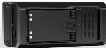
BP-272 attached (Rear panel view)

Utilizing the high capacity Li-ion battery from the ID-51A and ID-31A handheld radios. A 13.8 V DC external power supply can be used for operation and charging of the BP-272.