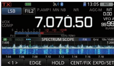
Display example of real-time spectrum scope and waterfall

Performance seen with the IC-7300 and IC-9700 spectrum scope is at the tip of your fingers for field operation. You can quickly see band activity as well as finding a clear frequency, all in the compact radio and not as an expensive add-on.