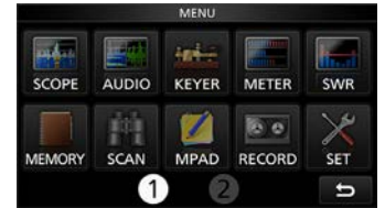
Menu screen example