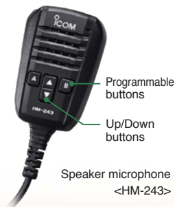
Speaker microphone <HM-243>

Enjoy portable operations with the supplied HM-243, programmable speaker microphone. Perfect for operation with the IC-705 safely secured in the optional LC-192 backpack. User assignable buttons put functions like frequency and volume adjustments at the tip of your fingers, without removing your backpack.