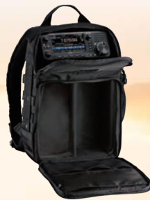
LC-192 Multi-function backpack

Designed to be the "Ultimate", must have accessory for the IC-705, the LC-192 is the perfect utility backpack. Features like a safety strap, with a 1/4"-20 mounting lug to keep the IC-705 from accidentally falling out of the custom radio compartment, to the user adjustable internal panels for custom compartments for antennas, battery packs, or other items necessary for an afternoon SOTA activation.