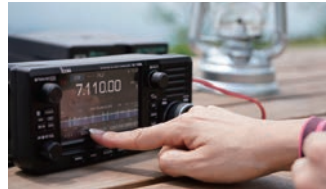
Touch screen display

The large 4.3" color TFT touch LCD, same size as the IC-7300 and IC-9700, offers intuitive operation of functions, settings, and various operational visual aids, such as the band scope, waterfall, and audio scope functions.