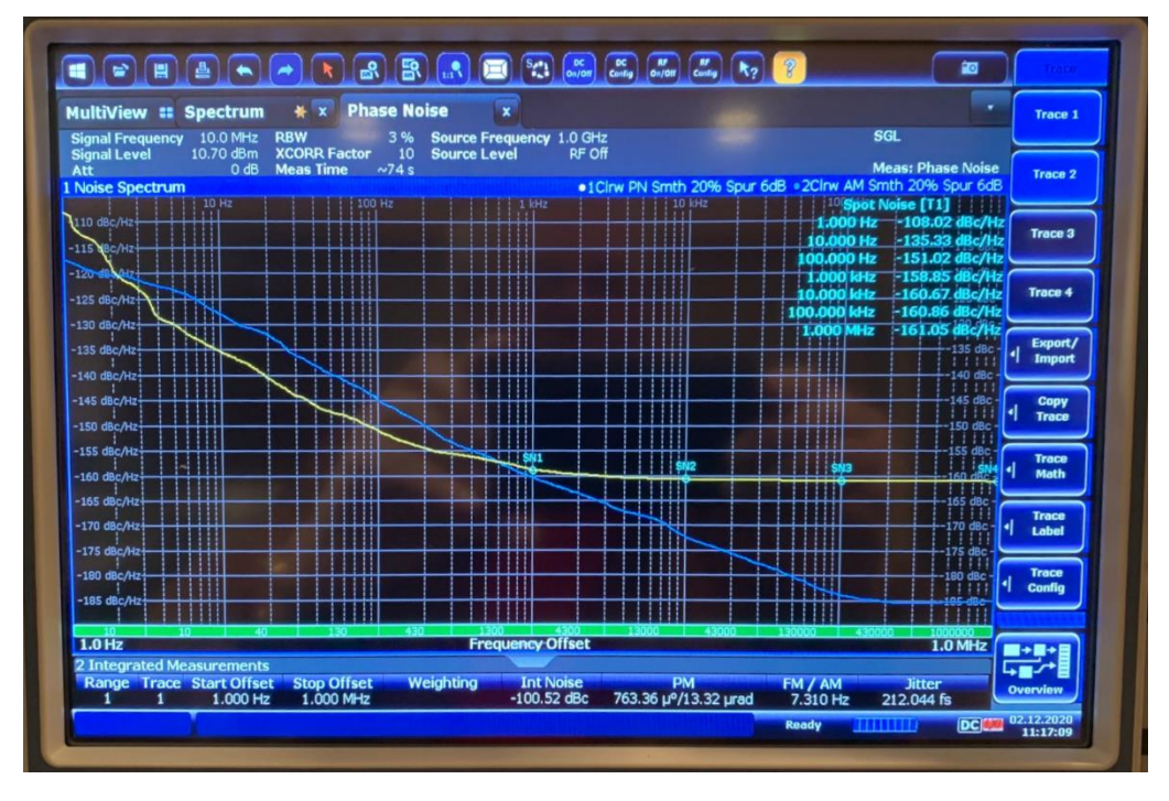
Figure 2. FSWP AM Noise Chart (taken on R&S FSWP Signal Analyzer).