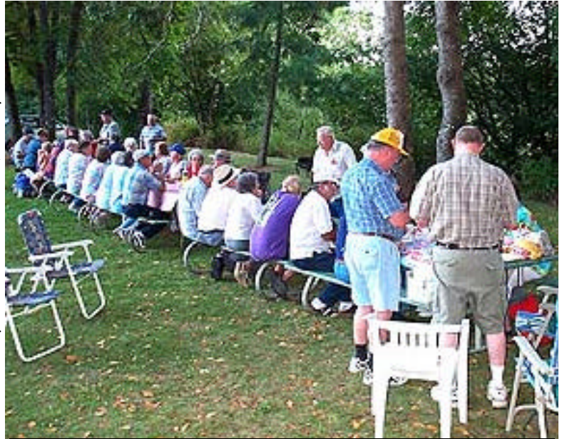
Club members and guests enjoying good food and good company at the Annual Icecream and Hotdog Social at Singleton County Park, August 15, 2002.